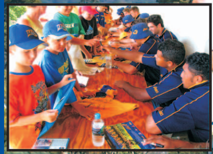
Parramatta Eels Visit