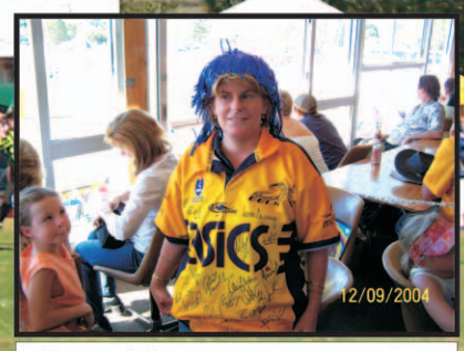
One of the many supporters