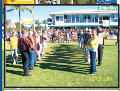
1960's guard of honour